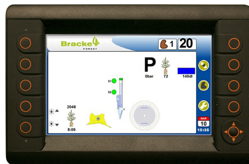
PLC-based control system.