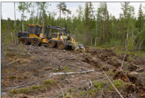
The Bracke T26.b is mounted on a medium-sized or large prime mover.