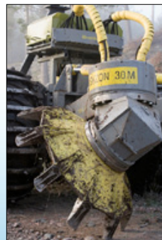
Discs with replaceable teeth.