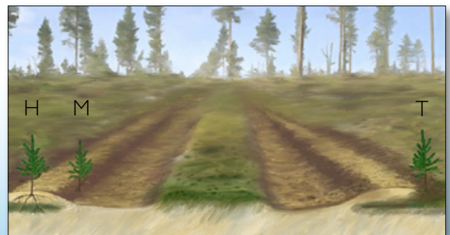
The Bracke T26.b creates planting spots with inverted humus (T), mineral soil mounds on inverted humus (H), and mineral soil mounds (M).