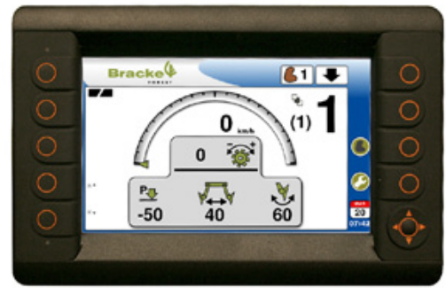
Bracke Growth Control is a PLC-based control system.