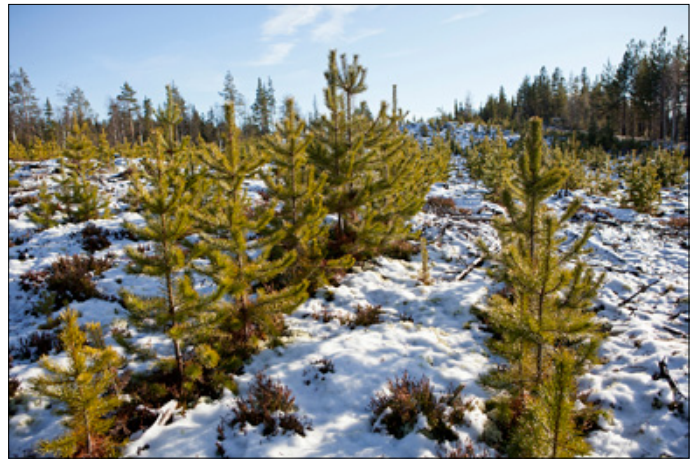
Very good production after scarification and sowing with the S35.a.

Bracke reserves the right to make changes. 2017-06-25