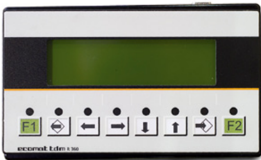
Bracke Growth Control is a PLC-based control system.