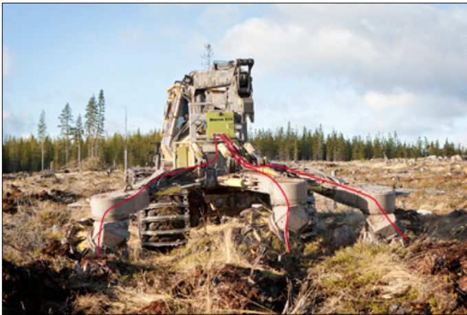
The Bracke S35.a can be attached to a one-, two-, or three-row scarifier.